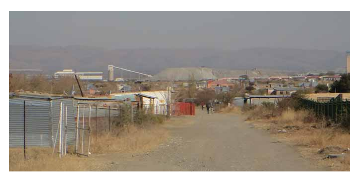
Lonmin operations near Segwaelane Village

As will be further seen in the next chapter, there is a long history of factional splits in the Bapo ruling lineage, and of struggles to control of the tribal authority and its resources. Matters came to a head in April 2008, when a group loosely organised around the chief - who had himself mentally ailed, and been kept at armslength from the tribal offices from 1998 - attempted to seize control of community assets and dissolve the traditional council. Although the group was blocked by a court interdict, the BMTA was thrown into administrative chaos. This forced the legal team to request the suspension of the royalty-to-equity negotiations until the situation had stabilised. Yet, such was the political turbulence in Bapong that, by December 2008, the Premier of the North West Province had appointed an external Administrator to run the tribe's affairs. Four years and as many appointees later, the Bapo administration was still under direct Provincial control, leaving its legal status open to interpretation. The consequent ambiguities around the legitimate representation of the Bapo's economic interests would now prove central in the next phase of the BEE story.