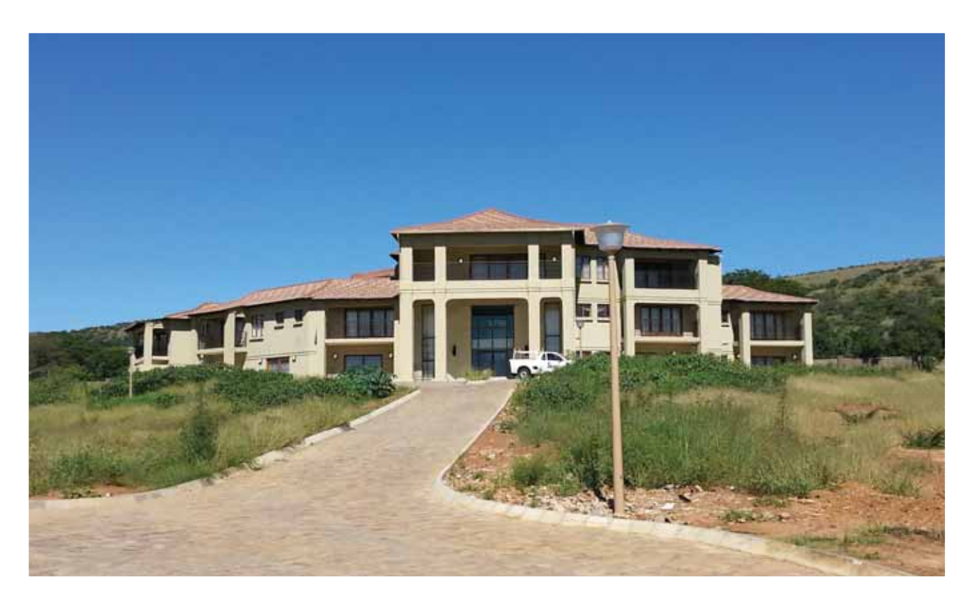
R80-million and rising: The Royal Palace in April 2014

Royal Family, to fill the administrative vacuum left by continued infighting and the failure to constitute a Traditional Council, suggesting a more complex relationship than a simple imposition. Nevertheless, to varying degrees, they were all subject to virtually the same complaints by our interviewees in the Rangwane -faction, <sup>84</sup> many of which were supported - albeit more reticently - by a former administrator in a separate interview. <sup>85</sup>